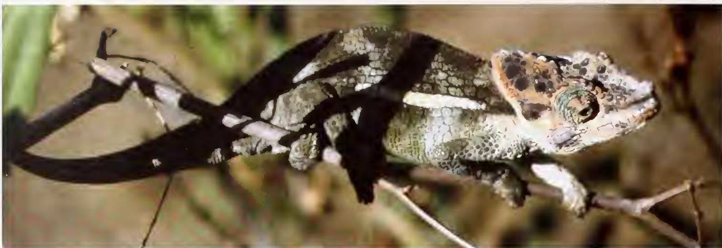
Fig. 6. Holotype of K. u. arytior ssp. n. in life.

species have been described from montane forests in Kenya and Tanzania (Menegon et al. 2009, Necas 2009, Necas et al. 2009) and several subspecies have also been raised to species status based on genetic divergence and detailed morphological studies (Mariaux et al. 2008). No doubt more species remain to be discovered in the still poorly surveyed mountain ranges across East Africa. The discovery of K. uthmoelleri in the South Pare Mountains also shows that species' distribution ranges are not well documented and it is quite likely that K. uthmoelleri also occurs on other massifs in-between these now known populations, such as Mt. Kilimanjaro and Mt. Meru (Fig. 8). K. uthmoelleri has a similar distribution to the Trioceros sternfeldi species complex, including the recently described T. hanangensis (Krause & Böhme 2010). Although the phylogeography of all T. sternfeldi populations has not been investigated, the Mt. Hanang population has been identified as a divergent sister clade to the Mt. Meru/ Kilimanjaro populations. A similar pattern is found in K. uthmoelleri , the Mt. Hanang populations morphologically di-